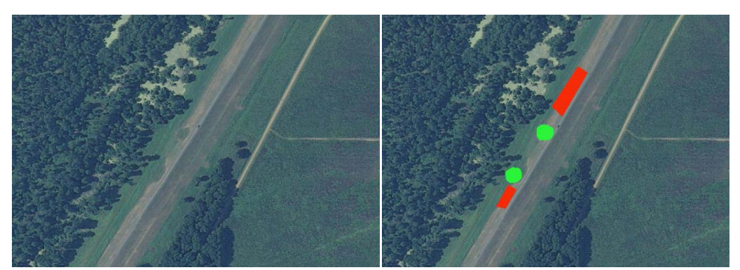
Figure 1. Left Image: Actual levee segment. Right Image: Mask segment. Green: landslide; Red: healthy levee.

The data was collected on June 16, 2009, which according to the National Ocean and Atmospheric Administration (NOAA) data was hotter than usual and was the 6^{th} driest June since 1895 for that region [4]. Ground truth for landslides on the levees was obtained using optical imagery from the National Agriculture Imagery Program (NAIP), the Army Core of Engineers records, and this