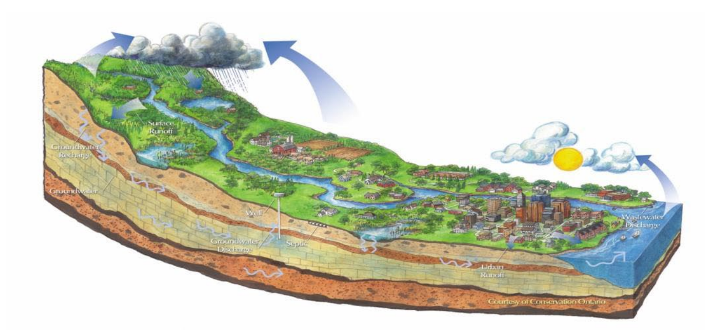
Figure 2. Watershed schematic with hydrologic cycle and human alterations.

As used here, Water Resources is defined as the total supply of surface and ground water suitable for use, and Water Resources Management as the process of ensuring that water of sufficient quantity and quality is available for beneficial uses. Management includes regulatory actions to conserve and protect water resources, planning to provide future resources, and actions and structures to store, divert, purify, and use water. Beneficial uses subject to management include the traditional classifications of agricultural, industrial, municipal, hydropower, navigation, and recreation plus environmental quality and habitat. Storm and flood damage reduction, representing the inverse problem of too much water or water in the wrong place, is included in the water resources management definition also. Figure 2 illustrates a schematic watershed with important elements of the hydrologic cycle and human modifications.